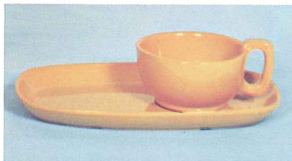
SOUP AND SANDWICH SET 4SC—11 OZ. SOUP CUP 3.75 6P—11" PLATTER-TRAY 4.50