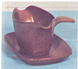
6S—TWO-SPOUT GRAVY 6.50 5PS—9" PLATTER-TRAY 3.75 6S/ST—TWO-SPOUT GRAVY/W TRAY 10.00