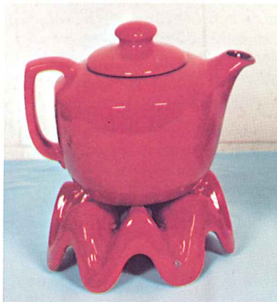
5TL/W—TEAPOT & WARMER SET 20.00 5TL—12-CUP TEAPOT WA1—WARMER 13.00 7.50