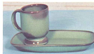
COFFEE AND DESSERT SET 3.75 5PS—9" PLATTER-TRAY C2—10 OZ. MUG 3.25 (or choose your own style Mug — See Pg. 9)