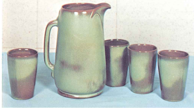
9.25 80—2 QT. PITCHER 5L—12 OZ. TUMBLER 3.75