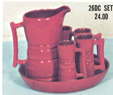
26DC SET 24.00 26D—1 QT. PITCHER 6.50 26DC—3 OZ. JUICE 3.25 91—TRAY 4.75