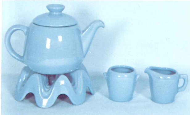
6T—6 CUP TEAPOT 9.25 5DA—6 OZ. CREAMER 3.25 WA3—6" WARMER W/CANDLE 5.00 5DB—6 OZ. SUGAR 3.25