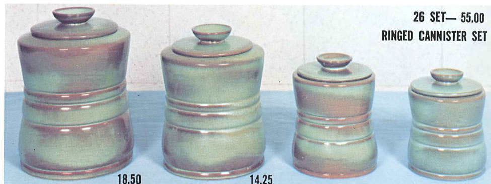
26 SET— 55.00 RINGED CANNISTER SET 26F—FLOUR, COOKIES, CORN MEAL 18.50 26S—SUGAR 14.25 26C—COFFEE 12.00 26T—TEA 11.00