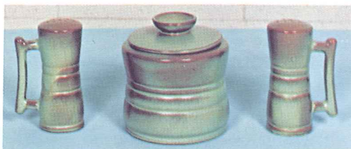
26G—SUGAR/GREASE 9.25 26H—SALT & PEPPER 6.00 26GH—4-PIECE SET/BOXED 15.00