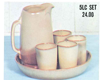
5LC SET 24.00 81—1 QT. PITCHER 6.50 5LC—6 OZ. JUICE 3.25 91—TRAY 4.75

*AVAILABLE IN: 8 STANDARD COLORS PLUS COFFEE BROWN AND NAVY BLUE — EXCEPT WHERE NOTED.